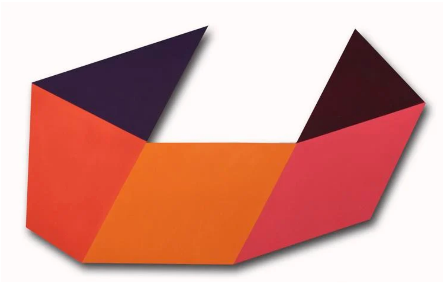
Bow (2017), acrylic and clay paint on shaped canvas